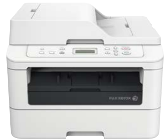
DocuPrint M225 dw 3-in-1 Wireless Multifunction Laser Printer