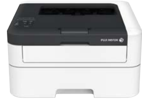
DocuPrint P265 dw Wireless Laser Printer