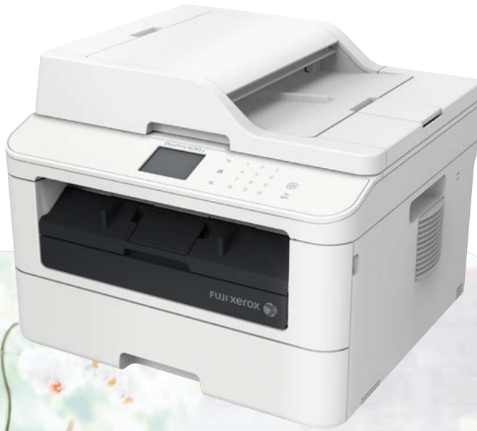
DocuPrint M265 z 4-in-1 Multifunction Laser Printer