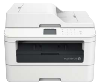
DocuPrint M265 z 4-in-1 Wireless Multifunction Laser Printer