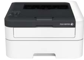
DocuPrint P225 d Laser Printer