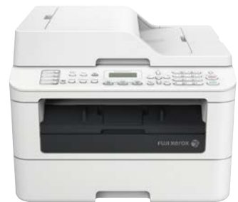
DocuPrint M225 z 4-in-1 Wireless Multifunction Laser Printer