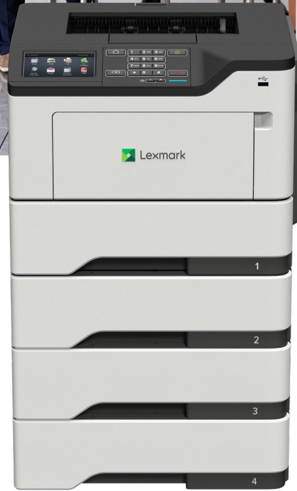
MS622de with optional trays