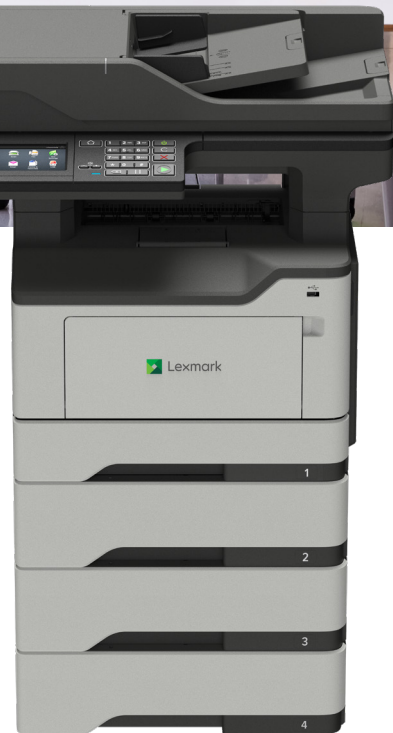
MX522adhe with optional trays