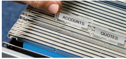
Clearly labelled files help improve efficiency around the office