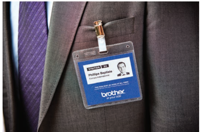
Printing of high resolution greyscale images (such as photographs) is possible using the specialised HG tape