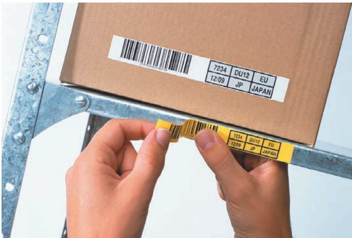
P-touch Editor 5 label design software supports many different barcode protocols

Connect to non-windows devices using the RS-232 serial port. By sending simple text commands containing the label format and the text/barcode to be printed, the labelling machine will print the label required. No driver or software needs installing memory of the QL-1050, then connect a compatible device directly to the serial port without the need for a computer (such as a barcode scanner or test equipment). Whenever the machine receives the text or barcode number it will add the data onto the required design and print your label. If needed, add special commands to change the printing options.