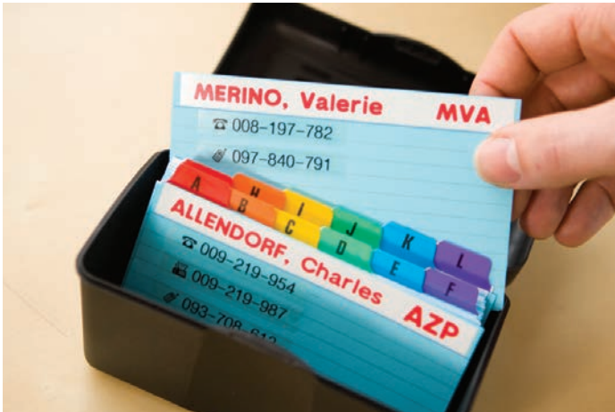
Find important information quickly through clear and precise labelling