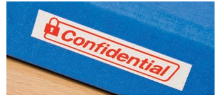
With a wide variety of label widths and colours available, there is a tape for all your applications