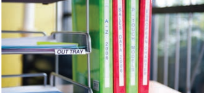
Create fully customised labels using the supplied easy-to-use label design software

Whether you need one or a hundred labels at a time, a Brother P-touch 9700PC will help ensure your day-to-day work runs as efficiently as you need it to. And with the wide variety of tape widths and colours available you're sure to find one suitable for your needs.