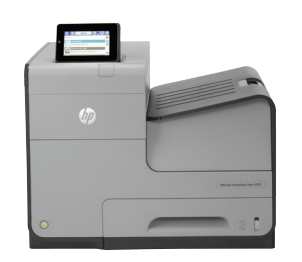
HP Officejet Enterprise Color X555dn

A printing revolution for your enterprise. Produce colour documents at up to twice the speed and half the cost per page of colour lasers.<sup>1,2</sup> Designed with advanced security and full manageability, this enterprise printer is built to last.