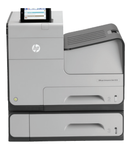
HP Officejet Enterprise Color X555xh