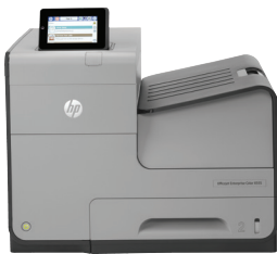
HP Officejet Enterprise Color X555dn

A printing revolution for your enterprise. Produce colour documents at up to twice the speed and half the cost per page of colour lasers. 1,2 Designed with advanced security and full manageability, this enterprise printer is built to last.