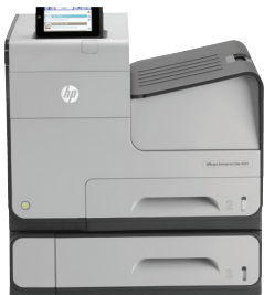
HP Officejet Enterprise Color X555xh